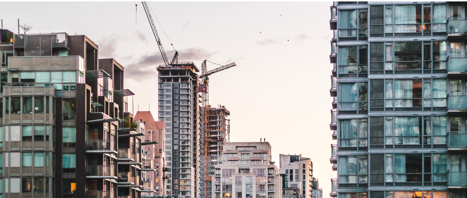
Value of BC multi-family sales (Greater than $5M)