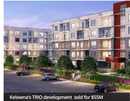
Kelowna's TRIO development sold for $55M