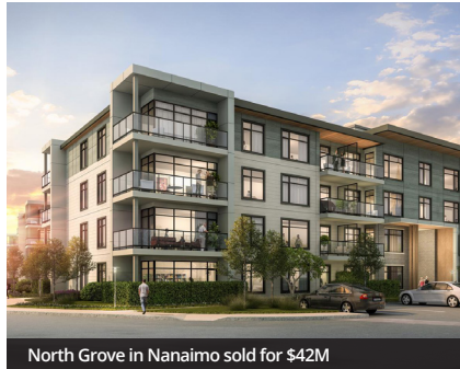
North Grove in Nanaimo sold for $42M